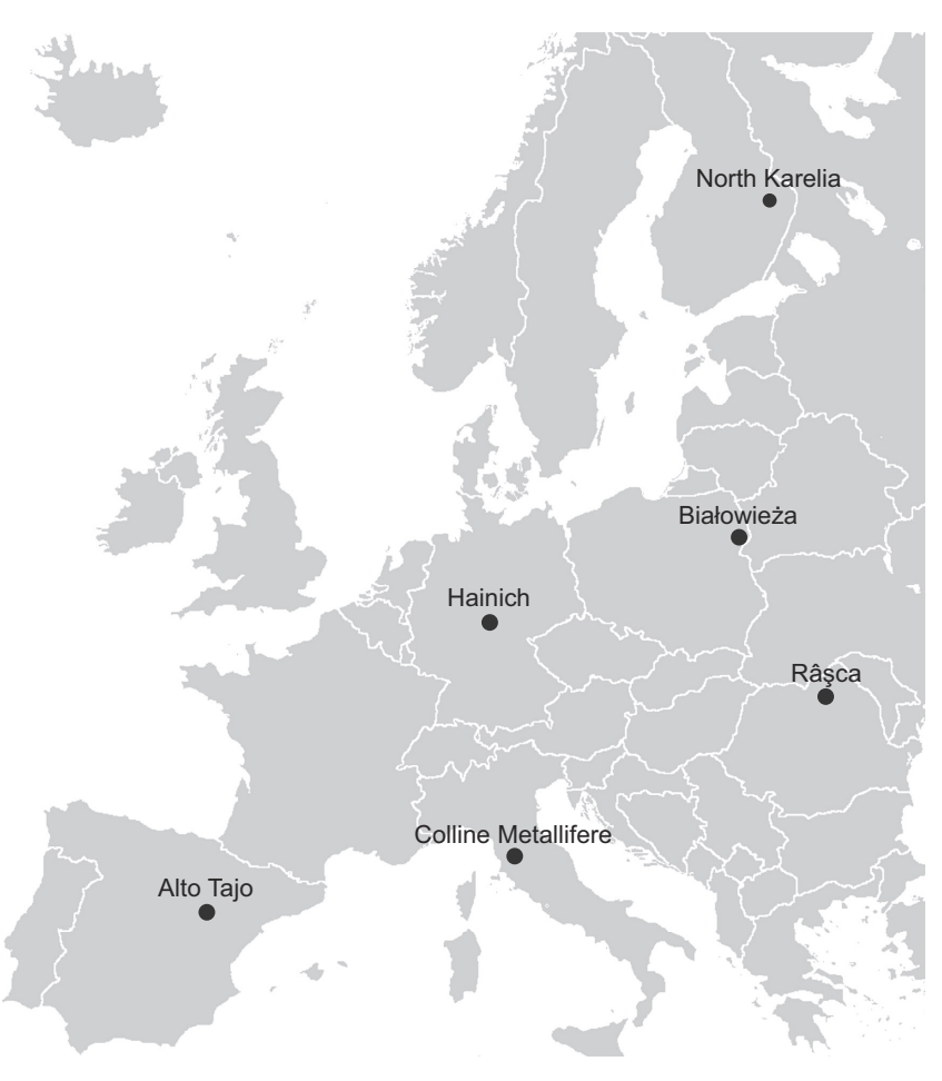
Figure 1. Map showing the location of the six sampling sites in the respective European country. See Table 1 for site and sampling details

The study was conducted in six mature forest sites (at least in the late to mid-stem exclusion stage) in six countries, spanning six major European forest types (Fig. 1, Baeten et al. 2013). Sampling was conducted over approximately 2 weeks in each of the six countries during the vegetation period (June to August), in either 2012 or 2013. The number of plots sampled varied in each site